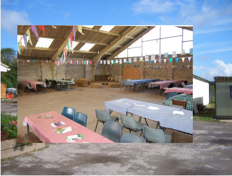
Set up for a barn dance

The large barn is a fantastic entertaining space being 225sqm and a having a capacity of 200 standing. With on site toilets, a large car park and outdoor space it is a very popular choice for parties and work outings such as barn dances and also for wedding receptions.