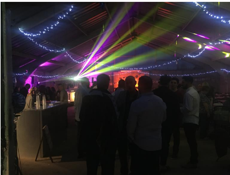
The barn at night